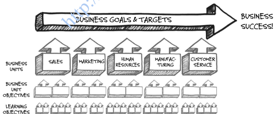
Figure D1.3. The Learning Objectives of Training Exist to Support Business Unit Objectives, Which Together Create Business Success